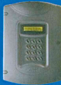
ACTpro 2000 Controller