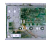
4 channel RS485 Interface