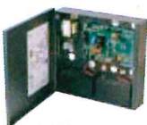
ACTpro 200 2 Door Expander